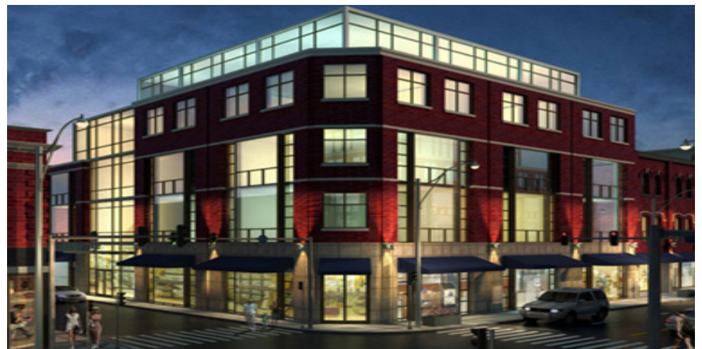
1128 Yonge St, Toronto, Canada

The APS site acceptance testing and compliance verification is scheduled late 2016.