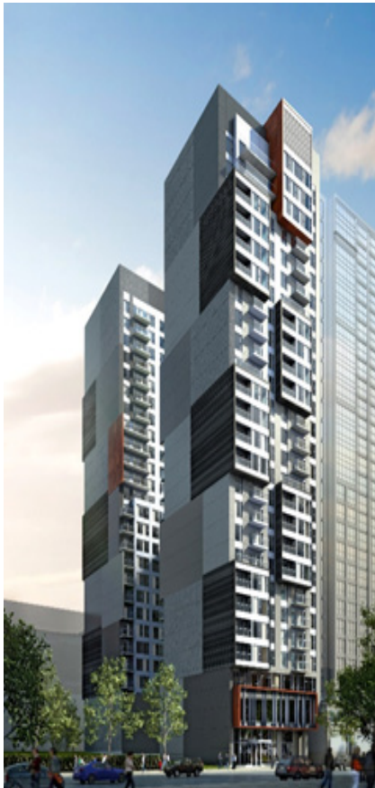
256 Rideau St, Ottawa, Canada