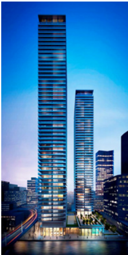
Docklands, London, UK